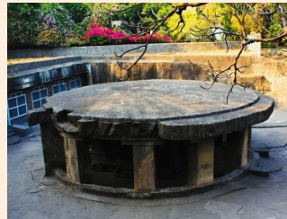
Pataleshwar Cave Temple