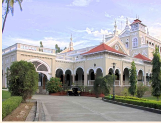
Aga Khan Palace