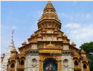
Shreemant Dagdusheth Halwai Ganpati Mandir