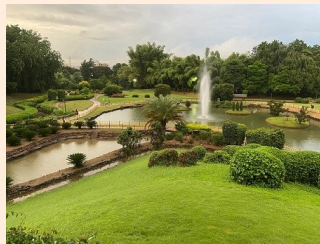
Okayama Friendship Garden